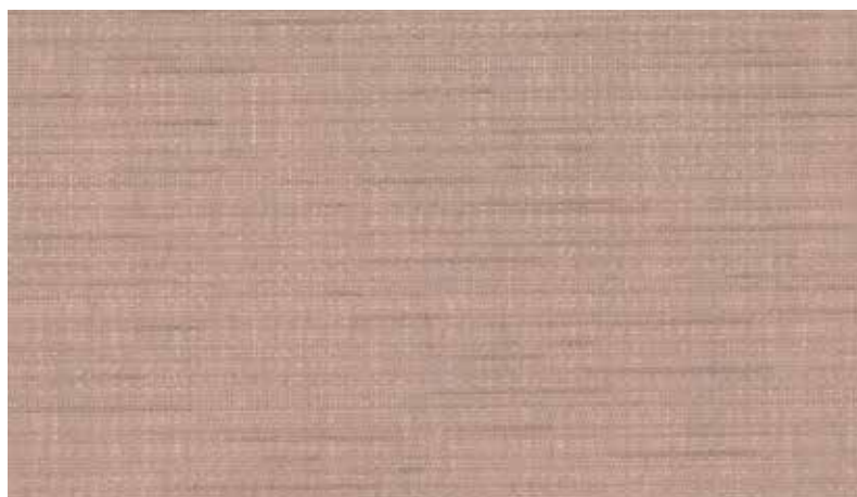
PUE01 - COFFEE