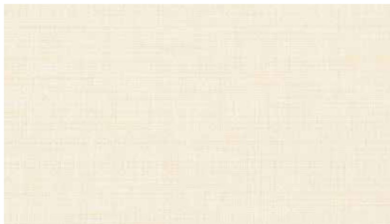
PUE01 - VANILLA