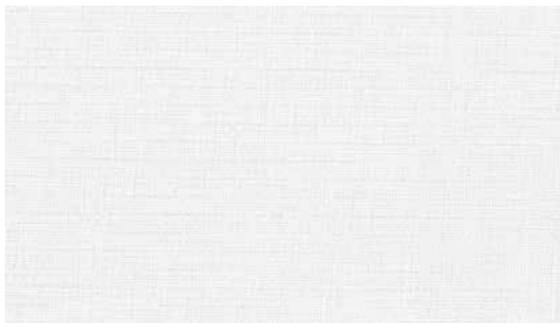
PUE01 - WHITE