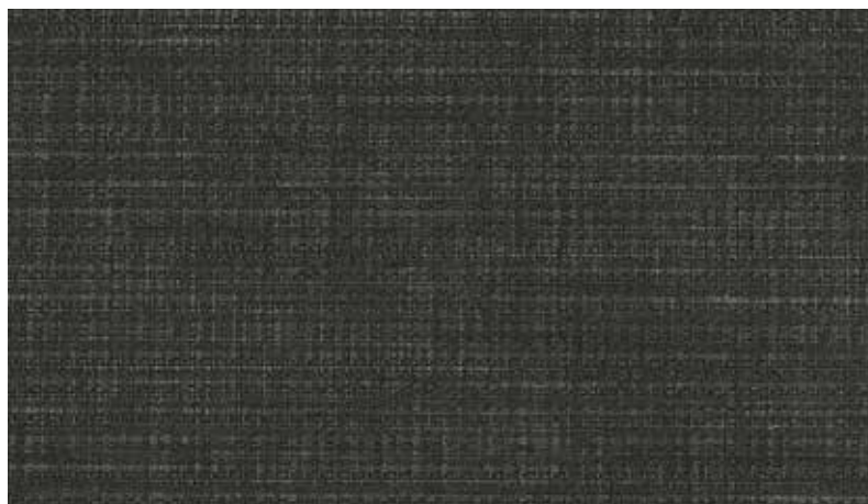
PUE01 - BLACK