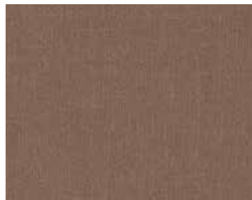
HAI02 - MOCHA