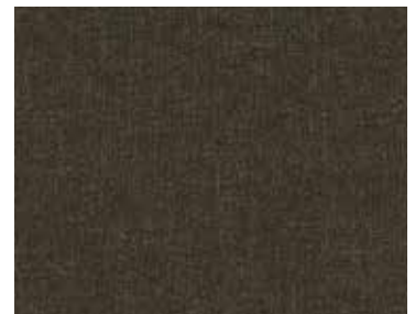
HAI02 - DARK GREY