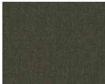
HAI02 - SMOKY GREY