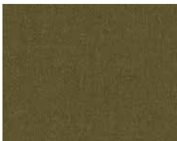
HAI02 - GREEN ARMY