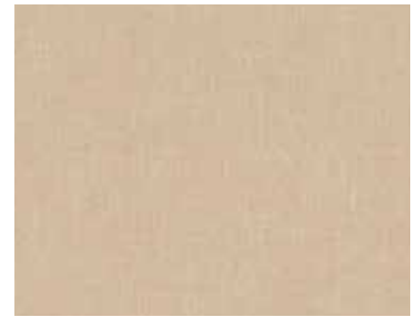
HAI02 - LIGHT BROWN