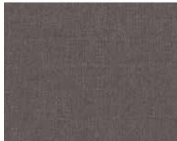
HAI02 - AUBERGINE