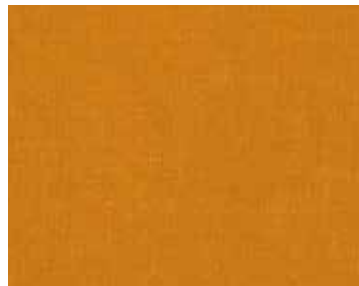
HAI02 - MUSTARD