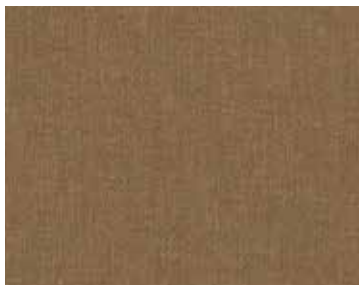
HAI02 - BROWN