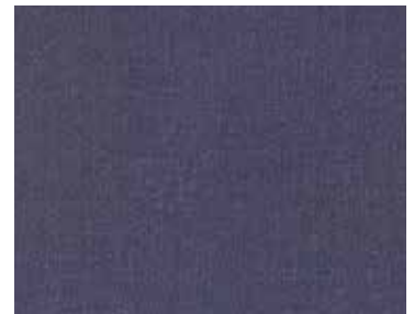
HAI02 - MIDNIGHT BLUE