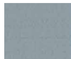
FLO02 - LIGHT GREY