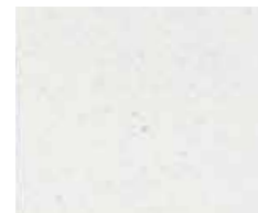
FLO02 - WHITE