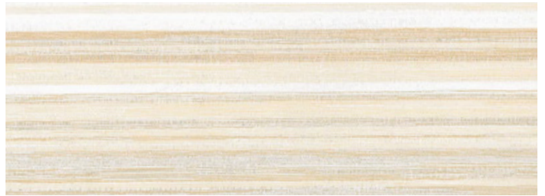
DOM01 - WHITE/BEIGE