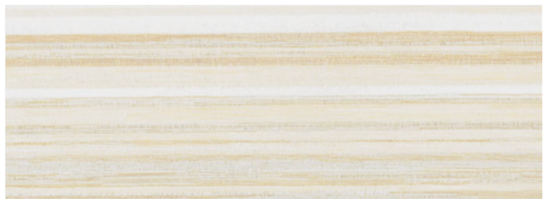
DOM02 - WHITE/BEIGE