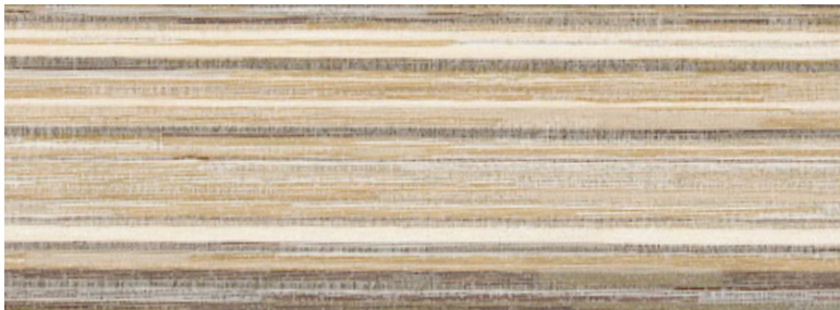
DOM01 - TAN/BROWN