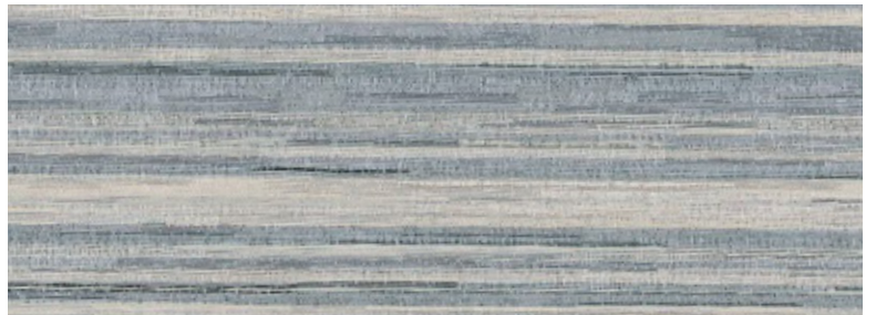
DOM01 - BLUE/GREY