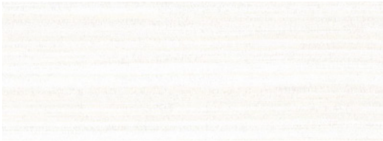
DOM01 - WHITE