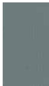
BAR02 - SMOKE