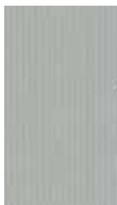
BAR02 - LIGHT GREY