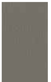
BAR02 - DARK CHOCOLATE