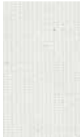
BAR02 - WHITE